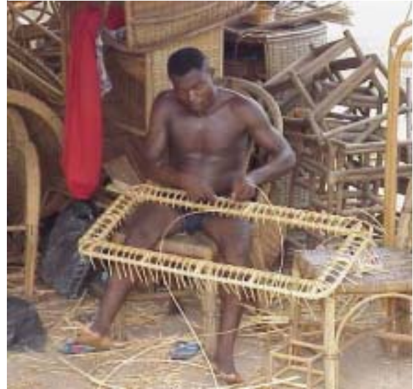
Rattan processor in Douala, Cameroon.

The prisoners at Buea Central are not the only group the project is helping. Through extensive household surveys in Nigeria, Cameroon and Ghana, team members learnt that lack of rattan cultivation, sustainable harvesting and processing were hampering widespread use of this versatile palm species. Alongside ecological studies and a focus on land tenure rights, the project concentrates on vocational rehabilitation through rattan processing and transformation of two vulnerable groups: bushmeat hunters whose livelihoods are increasingly threatened and criminalised by increased enforcement of Game Laws of their forest lands, and serial offending prisoners for whom vocational rehabilitation remains an important way to re-integrate successfully into society.