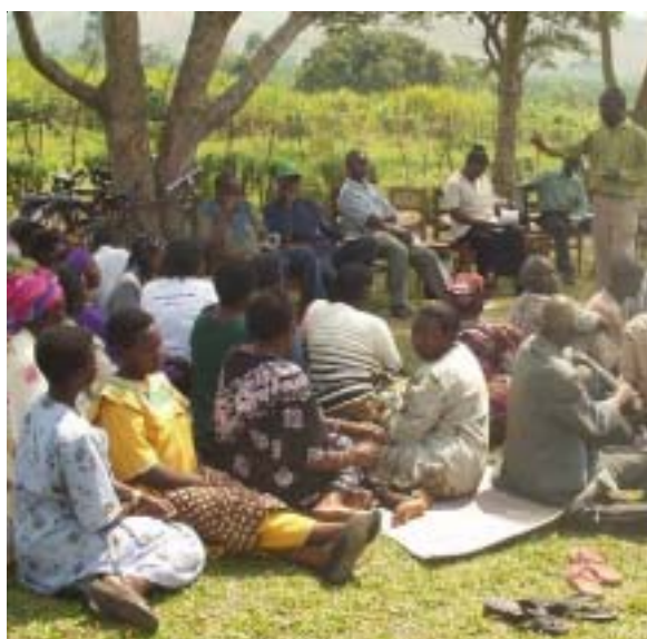
User group meeting.