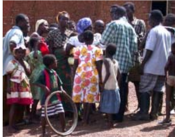
Interest in the field guide project is high.

We often assume that the people who live and work in the rainforest also recognise its plants, but this is far from universally true. A research team from the University of Oxford and partner organisations in Ghana, Cameroon and Grenada interviewed villagers in the three countries about their local knowledge of tree species. Surprisingly, no one – apart from specialist tree spotters employed by timber companies – was able to recognise correctly more than a third of the trees in the local patch of forest, and then it was often only in terms of very broad local names (like 'fire-wood') which cover many species. Yet, most of the people rely on the forest for their livelihoods!