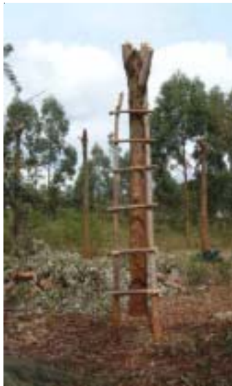
Hard crown pruning.

Whereas crown pruning seems quite drastic at the start, the regrowth can be used for staking beans