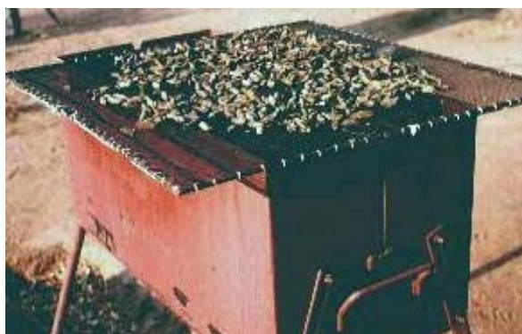
Solar dryer for mopane worms.

Diseases of mopane caterpillars are the most serious threat to a sustainable production in captivity, and the researchers are trying to identify a viral disease that has struck part of their breeding population. Funding permitting, they would like to continue to work closely with farmers to develop healthy community breeding systems.