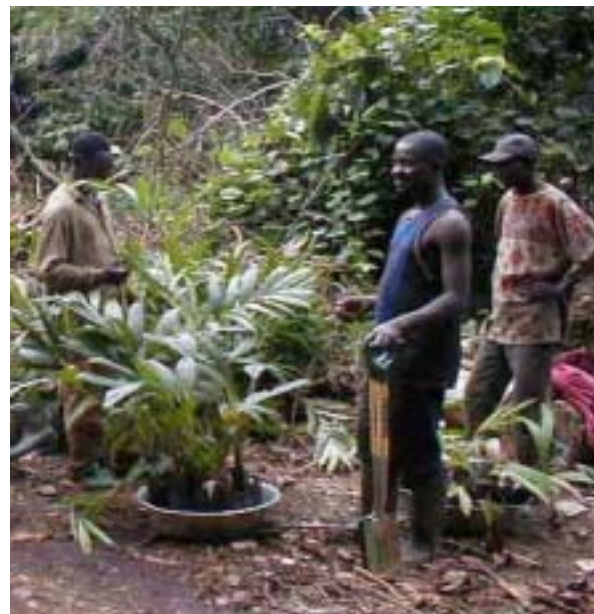
Rattan roadside nursery, Nigeria.