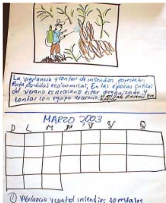
Participants in a workshop in Guatemala come up with their own ideas on how to use the information.