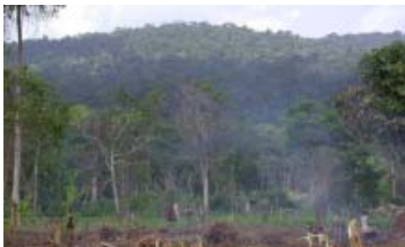
Rainforest in Cameroon.

Not only has this procedure helped to improve the 'Focus on Forests' website, it has also demonstrated a new way forward for the development of similar sites in true collaboration with the clients. With the help of leafy graphics and navigation buttons, the user is guided through the concepts of sustainable forestry as well as the consequences of losing biodiversity.