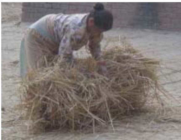
Woman collecting straw.

The mapping exercise, which will be published later this year, shows clearly that the livelihoods of the poor are a mosaic of diverse activities, of which forestry is only one piece. All four focus groups suffer from a lack of favourable policies and support services relevant to their livelihoods. Holistic approaches are clearly needed to help reduce poverty.