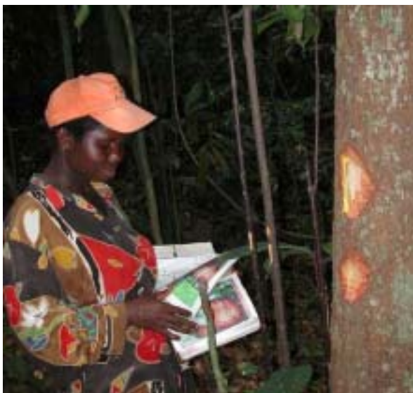
During an evaluation of the pictorial field guides in Ghana.

With the pictorial field guides, the team is helping to conserve the fragile environment of West Africa's remaining rain forests. And at the same time, it is contributing to an improvement of the people's livelihoods through creating better appreciation of their surroundings and the opportunities hidden in the forest.