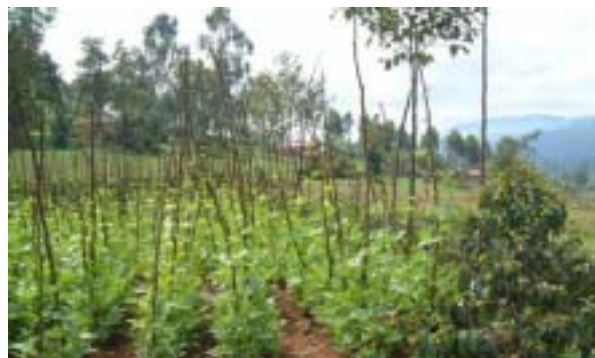
Prunings used as bean stakes.