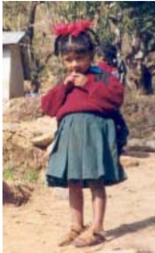
The children of the poor have to walk long distances to school every day.

Staff from the Nepali NGO ForestAction have put poverty back on the map – literally. Using a method developed by FRP, the team interviewed representatives of a variety of forest and tree-dependent stakeholders in Nepal to learn what they perceive to be the reasons, and possible solutions, for poverty in their country. They then assembled the results and displayed them graphically as a ‘poverty map’. Amongst the interviewees were Kami (blacksmiths) from an ‘untouchable’ caste as well as officers of the Ministry of Forests and Soil Conservation.