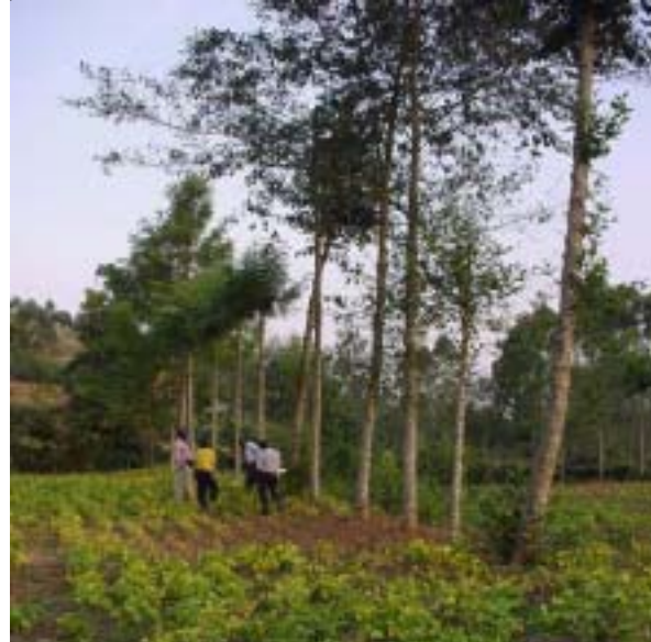
The effect of pruning on bean yield - unpruned trees in the middle.

or house construction, and of course firewood. Root pruning gives no immediate harvest, but does benefit crop growth and is easier to carry out and can be done by women. In a society where more and more men are away working in the towns, this is an important consideration.