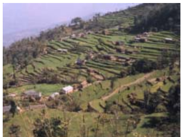
Typical village setting in Nepal.