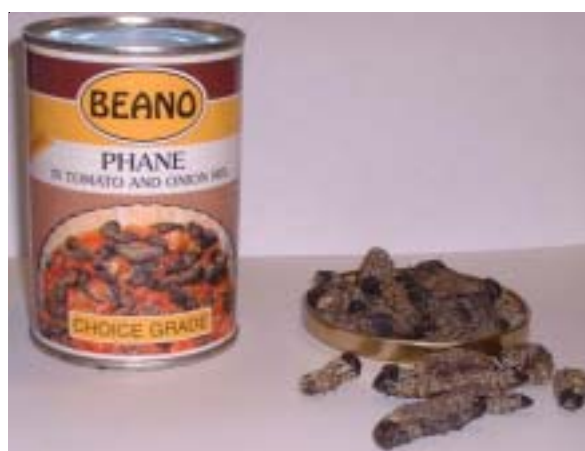
Canned and dried mopane worms.