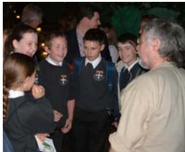
Bill Oddie and the students after the website launch.

And by the end of the launch, the children have not only learnt that forests matter – they also go home with an autograph from Bill Oddie.