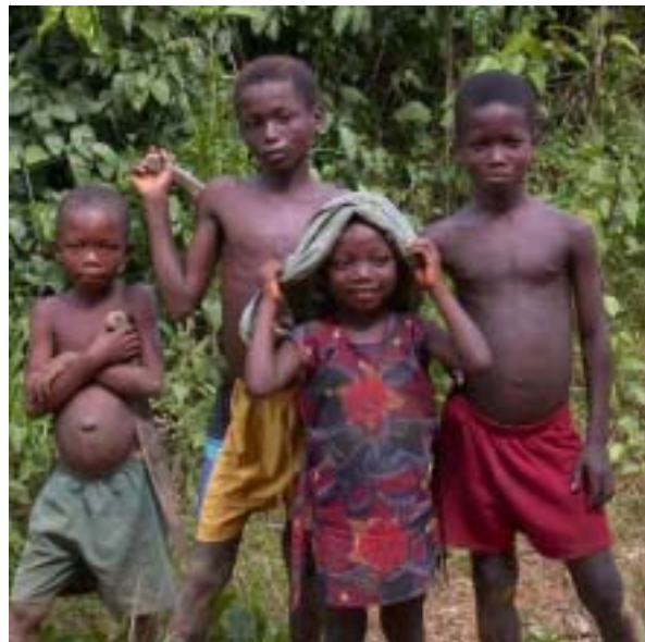
These children will know and appreciate their forest resources.