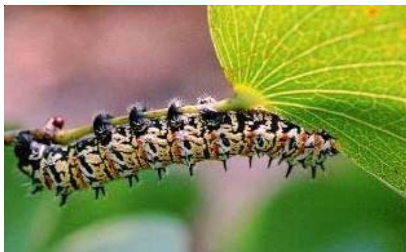
Caterpillar of Imbrasia bellina , the mopane worm.

Cheap sources of protein are an important food supplement for the rural and urban poor. One such source for the people in Southern Africa is the caterpillar of an emperor moth. The caterpillar feeds almost exclusively on leaves of the native mopane tree, hence its name: mopane worm.