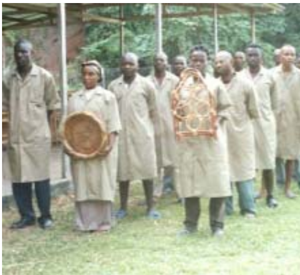
Prisoners from Buea Central Prison present their work to HE Oben, Minister of Environment and Forestry, Cameroon.